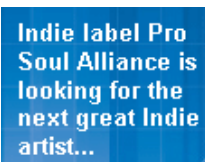
Pro Soul Alliance Is Looking For The Next Great Indie Artist!