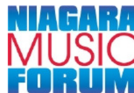
The 2009 Niagara Music Forum - October 17, 2009