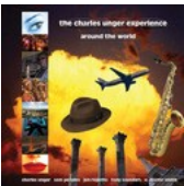
Around the World