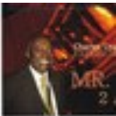
Mr 2 AM