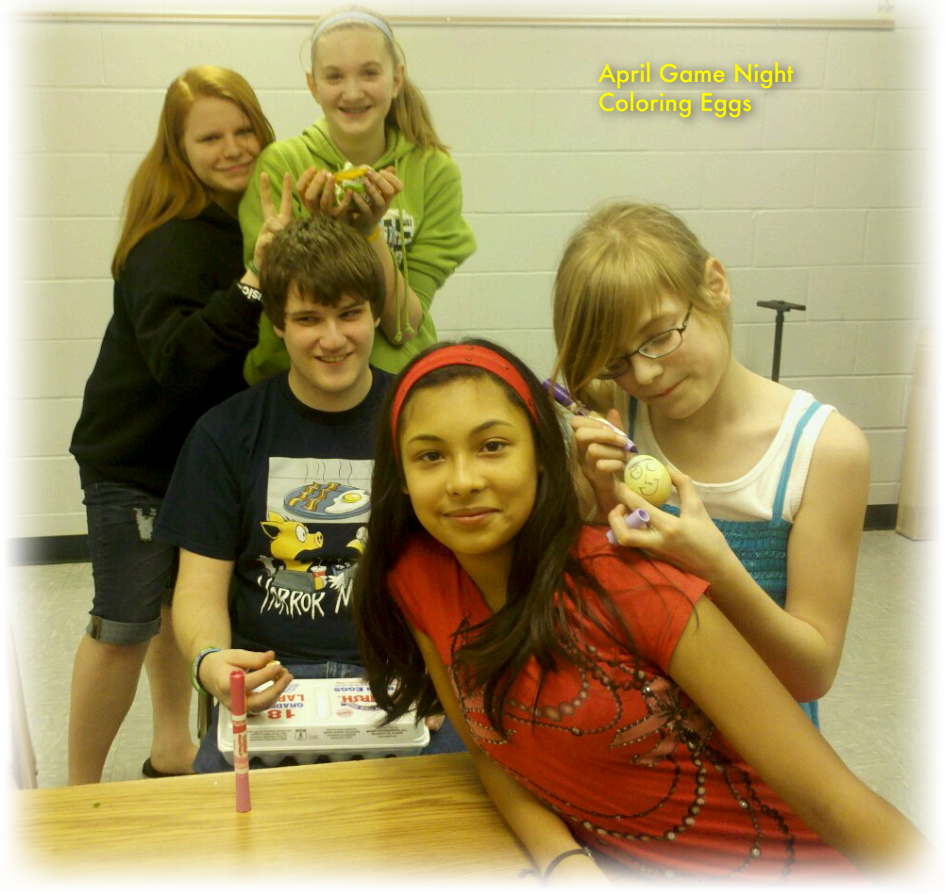
April Game Night Coloring Eggs