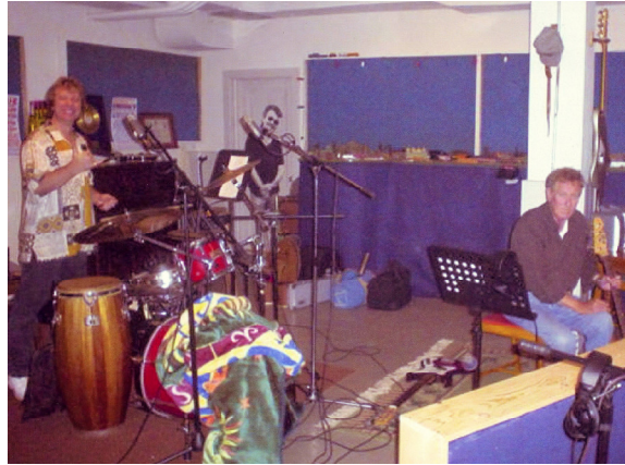
Setting up the studio for day one.