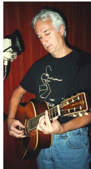
Johnny Cash's guitar – above, tuning up; right, in the vocal room.