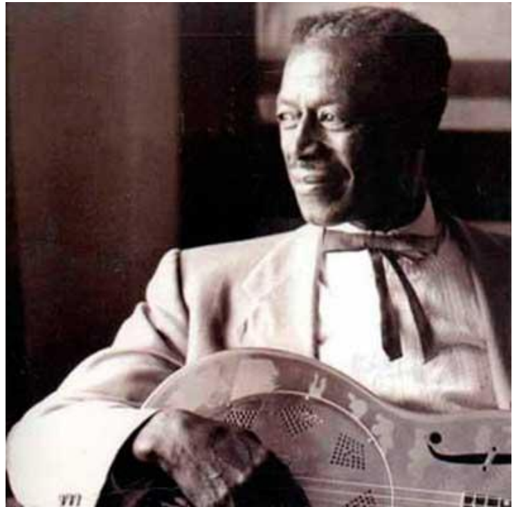
Eddie "Son" House, Jr. (March 21, 1902 - October 19, 1988)