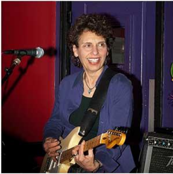
The Tristates Friday, October 21