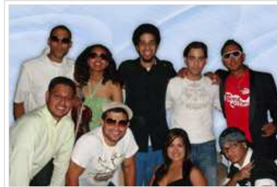
Award-winning Charlotte-based band Tropic Culture will bring their Latin-based world dance music to Boone this Saturday, January 31, when they open for the Solos Unit at the Dragonfly Theater & Pub.

The song “Eliminate The Hate” begins with the offbeat strum of an acoustic guitar and a cool burst of muted trumpet before the song’s funky backbeat and unstoppable riff kick in seconds later. The anthem about positive living and tolerance embodies everything that is Charlotte’s Tropic Culture—an award-winning nine-piece band that blends pop, rock, Latin and reggae sounds with flourishes of funk, jazz and more for a big, danceable sound.