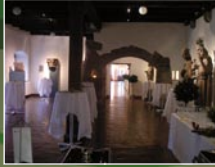
The convent museum in Klein Klingental, left, and its courtyard, right.