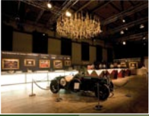
Basel Tattoo Lounge

Our hospitality offers are just as varied as our show, ranging from traditional to contemporary to exotic and our catering partner, the five-star Swissôtel Le Plaza Basel, will spoil you with a range of delicacies. More information is available from hospitality@baseltattoo.ch , Tel. +41 61 266 10 02.